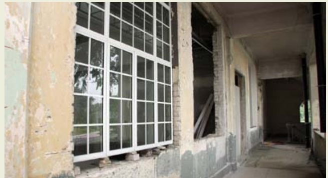
New window frames in place.