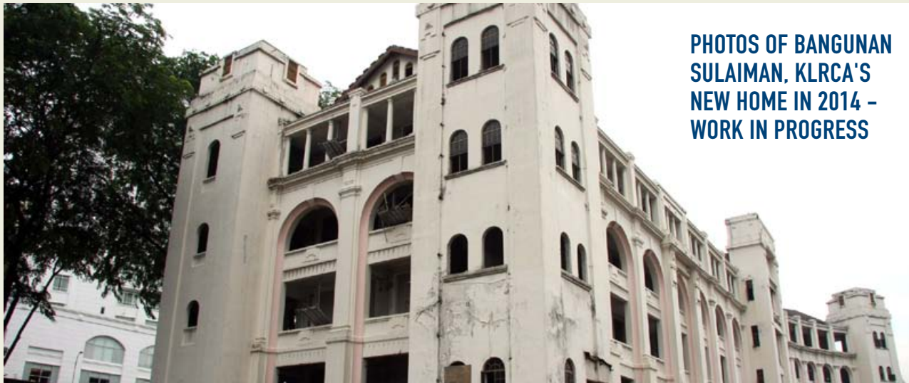
PHOTOS OF BANGUNAN SULAIMAN, KLRCA'S NEW HOME IN 2014 - WORK IN PROGRESS