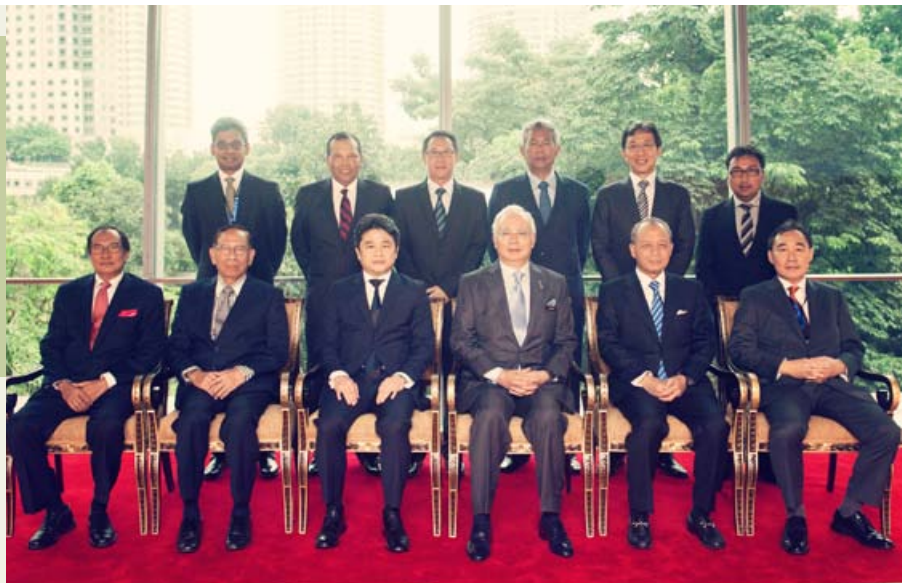
Mr Lim with the Prime Minister of Malaysia, Dato' Sri Najib Razak and other VIP delegates, IMLC 2012.

The present Government has implemented and will continue to implement various measures to strengthen these two institutions including the establishment of a Judicial Appointments Commission to make recommendations of appointment and promotion of Judges 10 , a substantially better remuneration scheme for judges, and pro-arbitration measures such as law reform, increased funding and support for KLRCA and encouraged use by Government agencies and government-linked companies of KLRCA as the appointing authority. The Bar would like to think that its representations had some role in these measures.