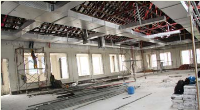
The new auditorium taking shape on the top floor.