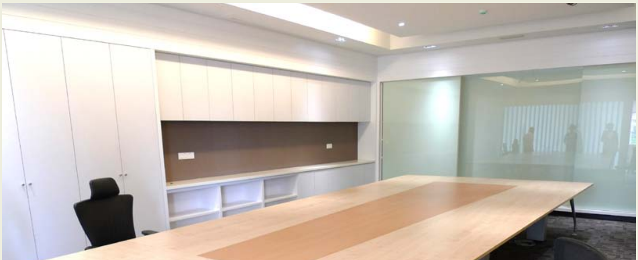
One of the completed hearing rooms.