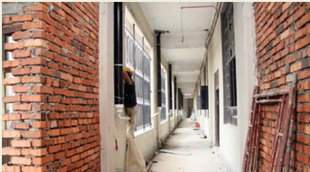
Rectification works to a corridor.